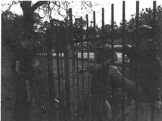
Bromfield students beautify New Orleans

44 Bromfield students and 3 Bromfield staff members spend the February week doing service projects in New Orleans.