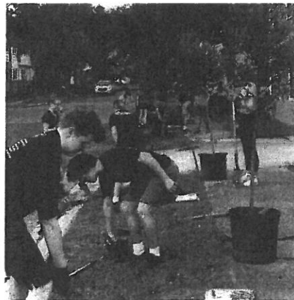
Planting trees as part of their service