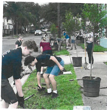
Planting trees as part of their service