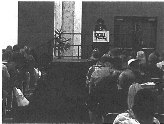
Barbi Kelley Leading the Conference

November 15 th at 5:30 PM - OML Training in the Cronin Auditorium