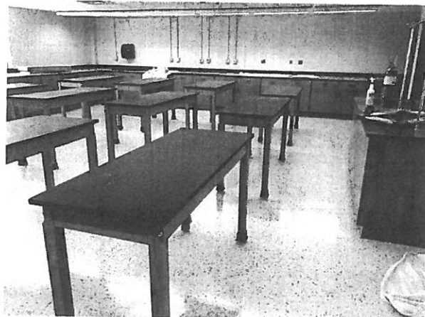
New Tables in the Classroom