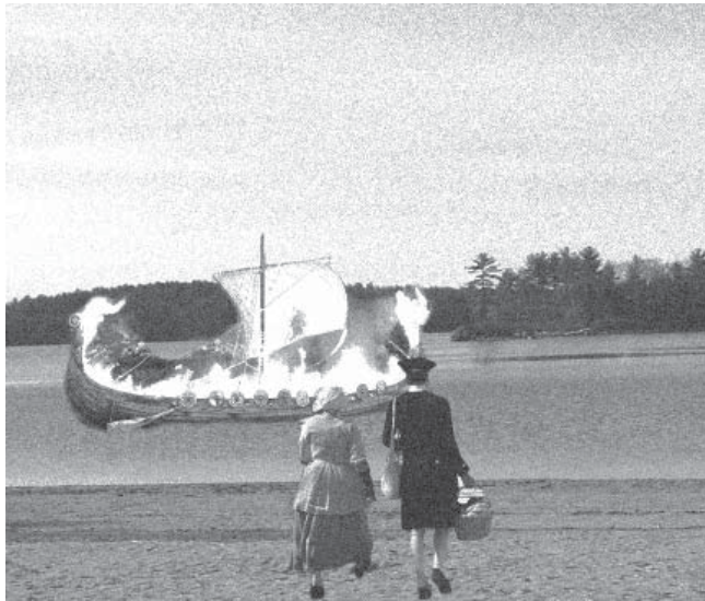
Town Hall archives produced this long hidden photograph of Hildreth sponsored burials on Bare Hill Pond. .

hanged for committing childish crimes, among them, swimming to second raft before passing level 4 of swimming